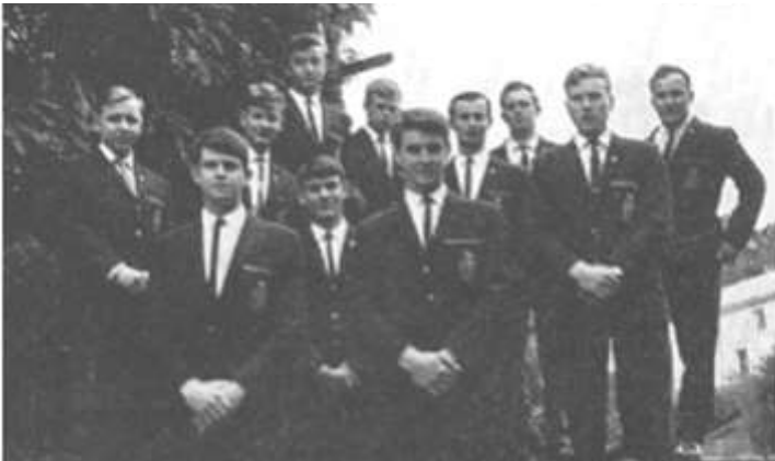
Our Graduating year in 1966.

Over the following few years all went on to complete further study at Melbourne University to gain a degree of Bachelor of Science in Forestry. This took a number of years due to the bureaucracy of the Forests Commission and delays resulting from the call -up for two years of military national service. This was the first group of Creswick graduates to all complete the Bachelor degree. Prior to this not all foresters were given this opportunity.