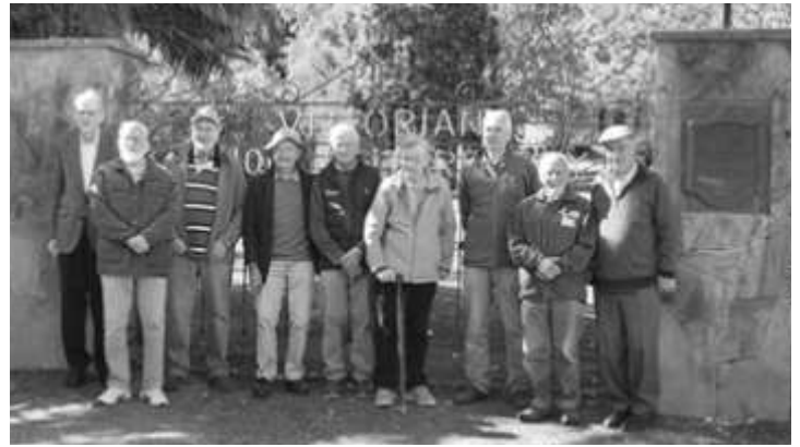
Our Group in 2024.

Creswick in the 1960's was a very welcoming town. The