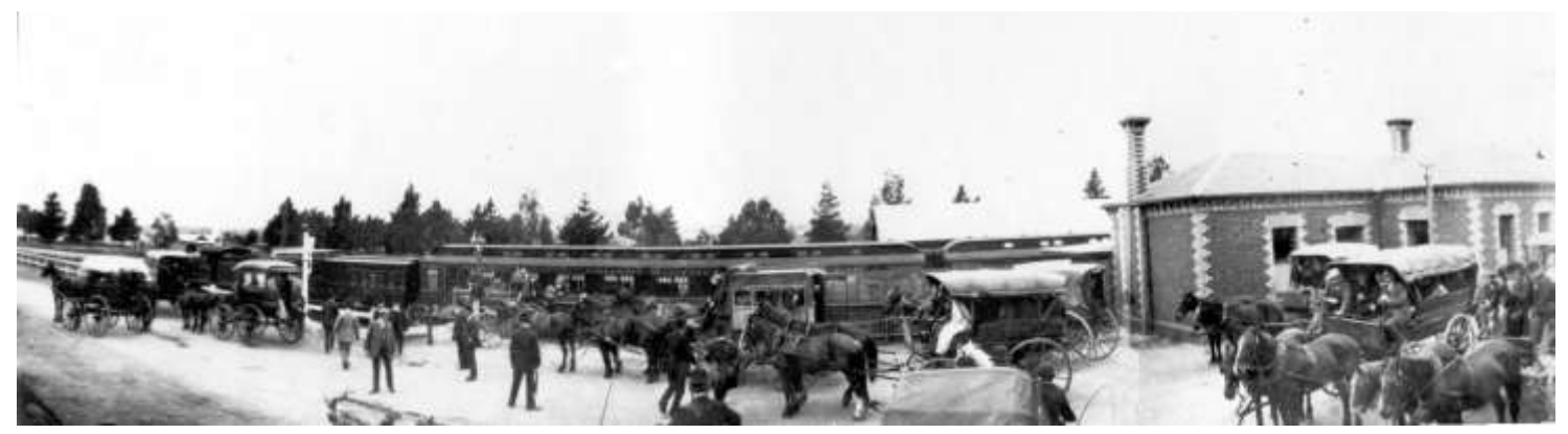
Visit of Commissioners at Creswick Railway Station

To celebrate the 150 years since the railway came to Creswick, this article is re-printed with the permission of the Creswick & District Historical Society