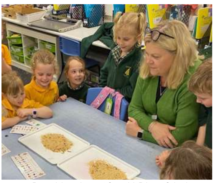
Preps doing science at Creswick Primary School