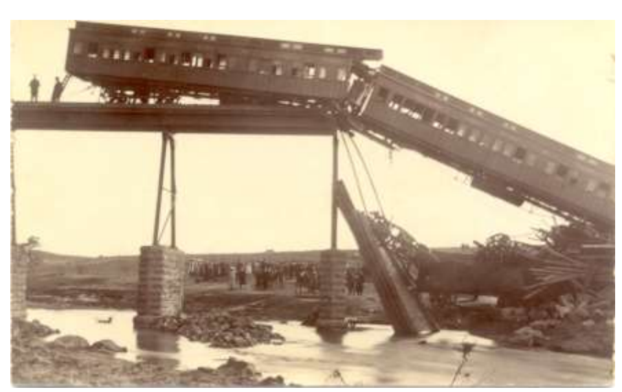
Railway accident at McCallum's Bridge, Creswick Maryborough Line, 19 August, 1909

With the increased use of private motor vehicles, rail use declined in the latter half of the twentieth century, and Creswick ceased to be a stopping point for trains. With the restoration of the rail service and building of a new station in 2012, there was an increased interest in this form of transport. Thanks to the enthusiasm of a Friends of Creswick Rail Group, led by Councillor Henderson, the former railway station is under repair and restoration. The difference is in the type of trains now in use. No soot in the eyes from these swift beasts as they scuttle across the countryside. No dog-box carriages, no wooden bench seats, just comfort for the travellers and an even speedier journey.