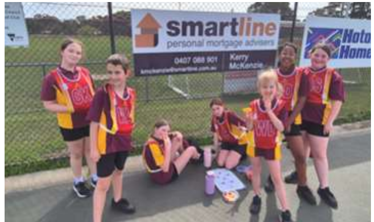
North Creswick PS Netball Team

A few students went off to compete in the next level of track and field athletics at Llanberris Reserve. They performed admirably against lots of other bigger schools and we were very proud of their efforts. We also fielded a football team, a netball team and played a friendly match against Invermay PS, held at the Creswick Oval in town. It was a great game of football with Invermay PS getting up by a few goals in the last quarter. The netballers came away with a strong win and they were excited to be playing against another school for some friendly competition.