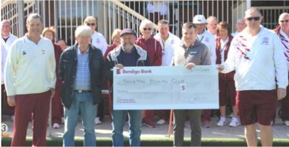
Opening Day Presentation